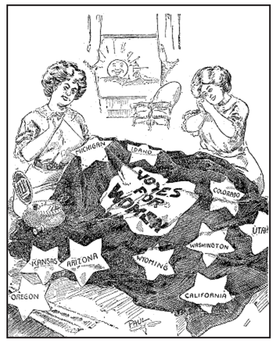
Jersey City Journal December 1912 (rpt. American Review of Reviews)